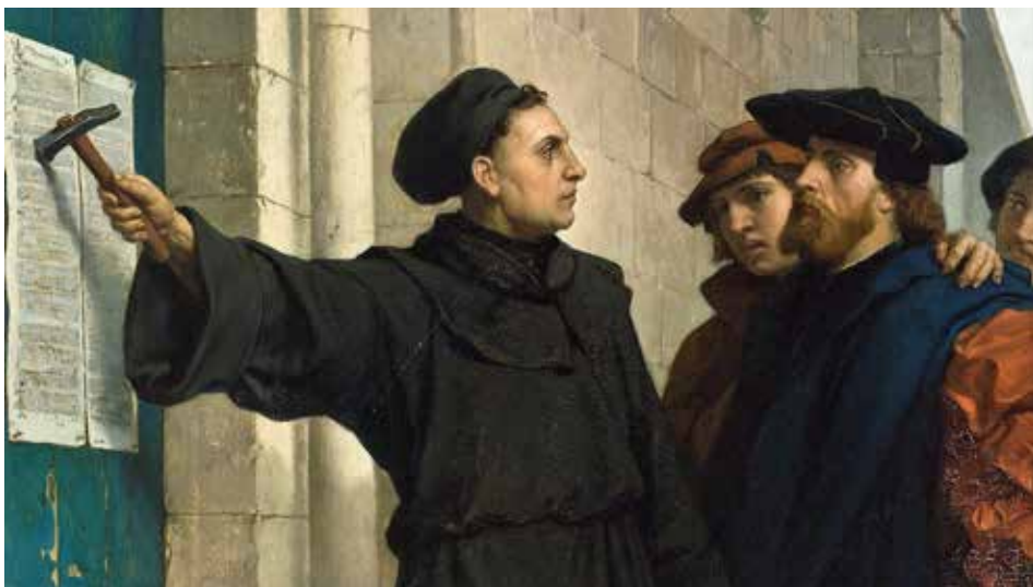
Luther posting his 95 theses in 1517. Painting by Ferdinand Pauwels.