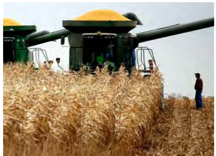
Farming is a vocation that serves others and, in so doing, serves God.